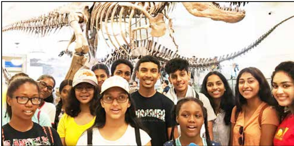
At the Museum of Natural History in NYC - during the first 1st Friday event Be a part of ALL the great things at OSLC !

Form Your Faith Find New Friends Feed Your Community Feel Safe and Have Fun